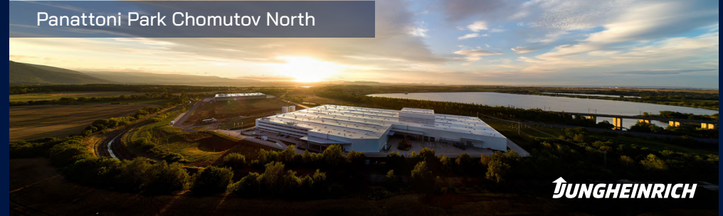
Panattoni Park Chomutov North