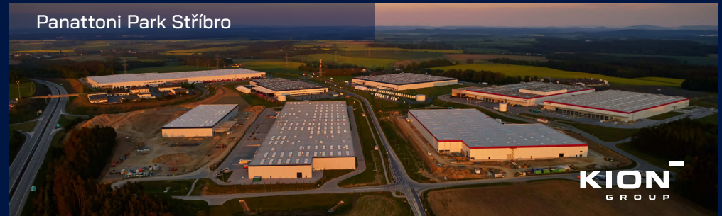
Panattoni Park Stříbro

Location: Ostrov u Stříbra, Pilsen Region