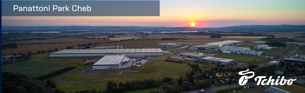
Panattoni Park Cheb