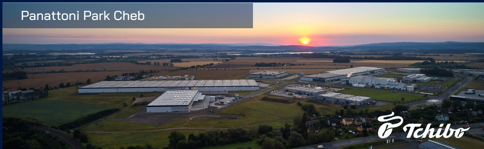
Panattoni Park Cheb