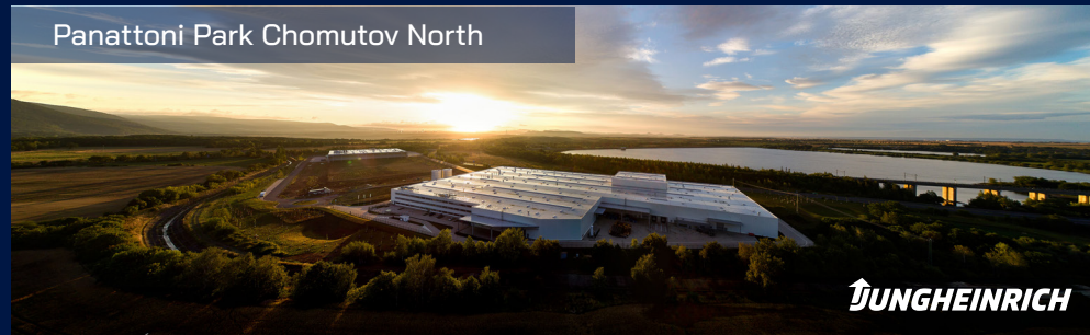
Panattoni Park Chomutov North