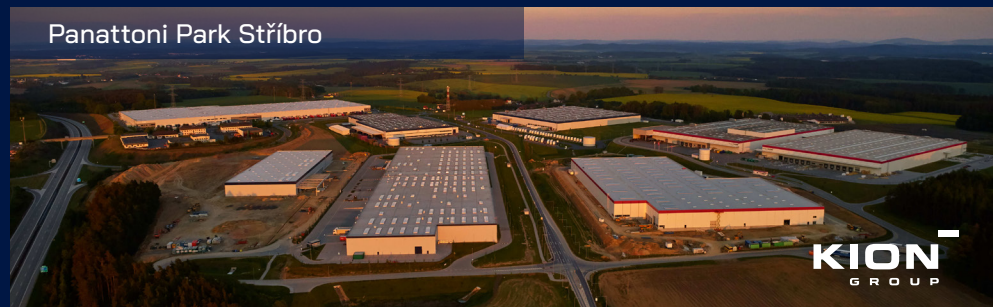
Panattoni Park Stříbro

Location: Ostrov u Stříbra, Pilsen Region