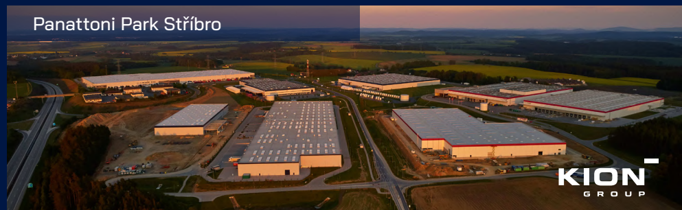
Panattoni Park Stříbro

Location: Ostrov u Stříbra, Pilsen Region