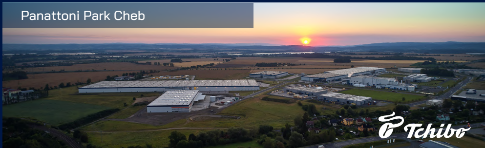
Panattoni Park Cheb